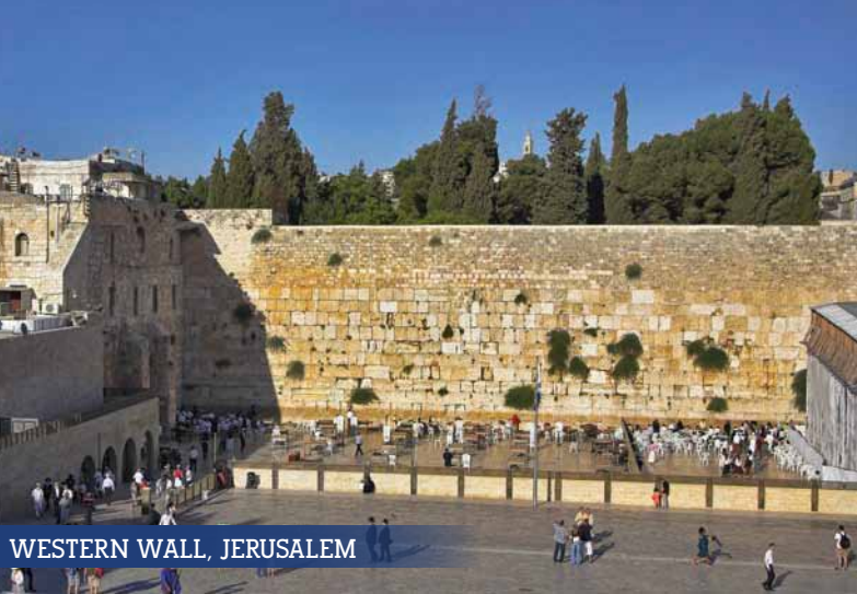
WESTERN WALL, JERUSALEM

in the north. We will follow our Lord's steps along the rim of the Galilee to the Mount of Beatitudes to share reminders of the blessings bestowed on His servants. The amazing story of how Ethiopia's Jewish community immigrated to Israel will come alive as we visit an Ethiopian absorption center. Last we will visit Nazareth and experience the reenactment of a village at the time of Jesus. Dinner this evening will be at the famous Lido Restaurant on the waters of the Sea of Galilee.