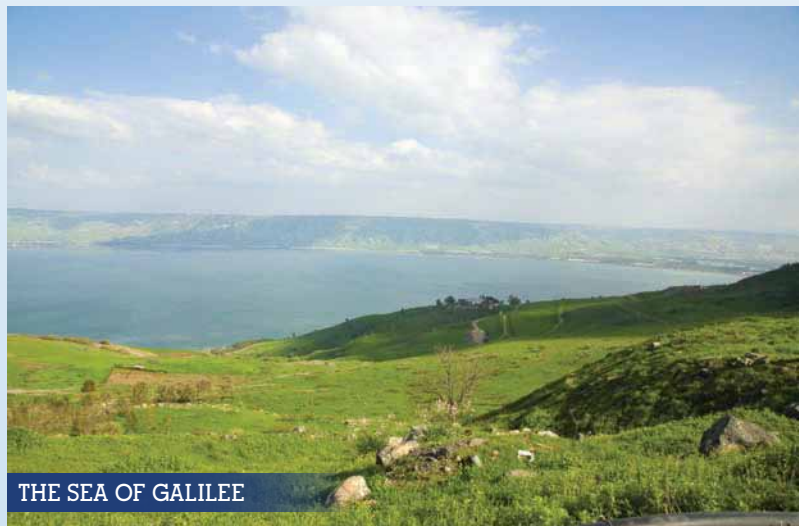
THE SEA OF GALILEE

After traveling north to the Lebanese border, we will meet with a representative of Kibbutz Misgav Am to learn about the challenges of life in this community located on the border with Lebanon. We will continue to Metulla, Israel's northernmost border town, where earlier cooperation between Israelis and the Lebanese at the "good fence" drew visitors from all over the world. Our day will include a visit to Caesarea Philippi, which marks the headwaters of the Jordan River and the place of Peter's great confession of faith in Jesus Christ. After an overview of Gamla, the "Masada of the North," we will continue to the Golan Heights and its "capital," Katzrin. Overlooking Syria, the Golan is one of Israel's most beautiful areas and most critical to its survival. In the evening we will view the history of Israel's north at the multiscreen Galilee Experience in Tiberias.