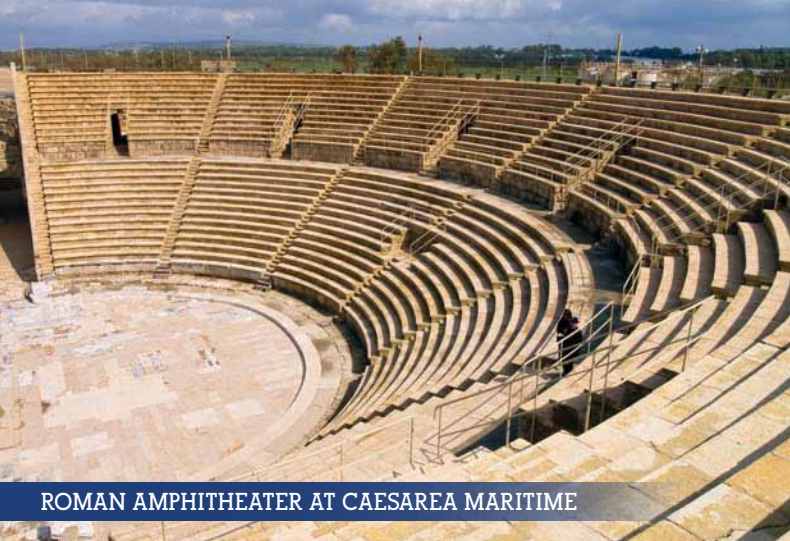
ROMAN AMPHITHEATER AT CAESAREA MARITIME

For more than 73 years The Friends of Israel has been vitally involved in major aspects of the rebirth of the modern State of Israel. At our inception, we reached out to suffering Jewish people fleeing the horrors of the Holocaust. Since then we have witnessed the rebirth of the nation, the reunification of Jerusalem, and the successive waves of Jewish immigration into the land from the far reaches of the world. We have lived through the greatest era of prophetic history in the past 2,000 years, and it has provided a wealth of knowledge and associations that place The Friends of Israel in a unique position. Why not embark on a once-in-a-lifetime experience and enjoy Israel with our veteran staff, experienced Israeli guides, and lovely accommodations? We want our friends to become your friends as we journey to the only place ever called the Holy Land. During the tour we also will: